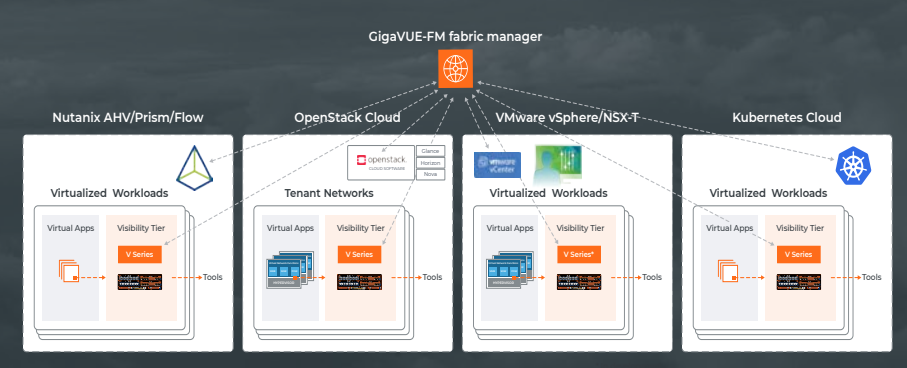
Figure 1. Certified integration of GigaVUE Cloud Suite with multiple private cloud environments.

GigaVUE-FM leverages dynamic service chaining and workload relocation monitoring to ensure visibility and policy integrity. GigaVUE-FM is tightly integrated with VMware, Nutanix, and OpenStack platforms to automatically provide continuous VM visibility in a micro-segmented SDDC.